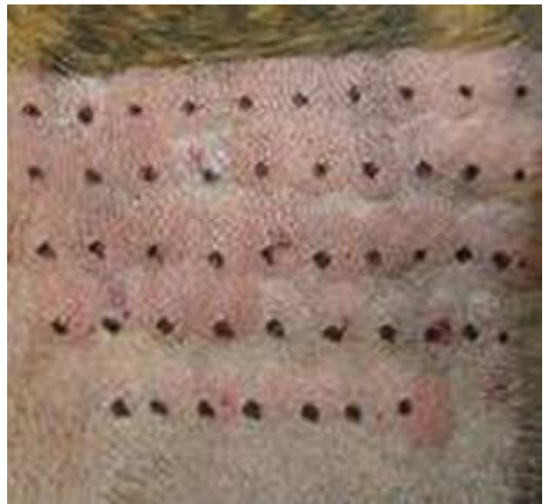
Reactive blebs.