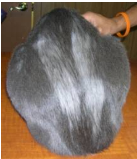
Non-lesional fur mowing.

In cats, the irritation pattern is not as characteristic. There are four common manifestations of atopy. Unfortunately, these same irritation patterns can be found in numerous other skin conditions and, in fact, up to 25 percent of atopic cats have multiple types of allergies.