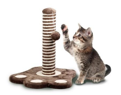
For illustration only

Younger is better. Cats that are between 3 to 8 months old and not overweight are the best candidates for a declaw surgery. Your cat should weigh at least 4 pounds prior to surgery. They do experience discomfort, but recover faster and with fewer complications than older and/or overweight cats. In general, we do not recommend declawing cats over 3 years of age because of the greater risk of physical and behavioral complications.